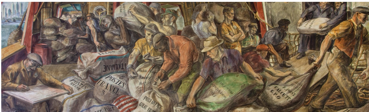
Detail from Reginald Marsh "Unloading the Mail". Photo by Carol M. Highsmith. Full scale image available at https://hdl.loc.gov/loc.png/highsm.24950 . No known copyright restriction.

Conference website: https://digital-humanities.open.ac.uk/letters2025/